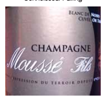
Moussé Fils Blanc de Noirs Cuvée Or Tradition Nv

This champagne is full of fruit on the nose and is generous in the mouth with a long lasting finish. It delivers quality from start to end.