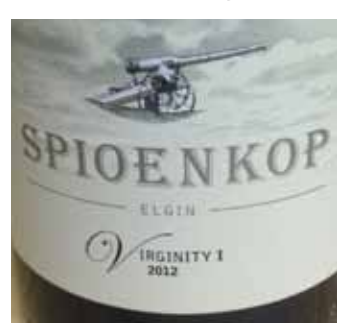
Spioenkop Virginity 1 2012

Crystal clear, light gold colour. You will discover a surprisingly complex nose of pineapple, peach, black current leaves, gooseberry, fern and some honey. This rebel has a well rounded finish that is crisp and crystal clear.